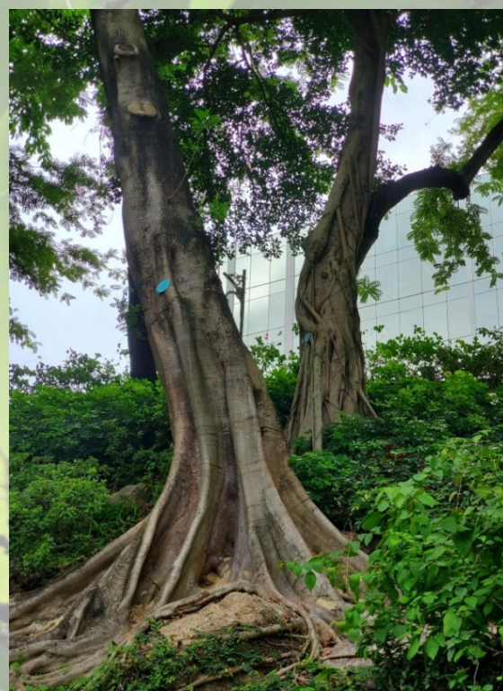
黃葛樹 (前) 及細葉榕對比 contrast between Ficus virens (front) and Ficus microcarpa